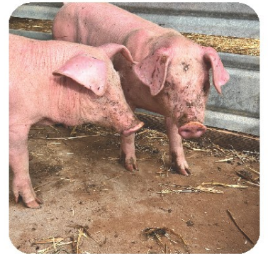
GEORGE & PEPPA